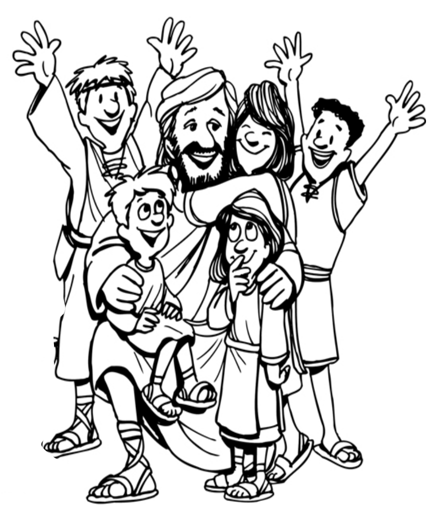
Read about it in Luke 18:15-17 and color in the picture!