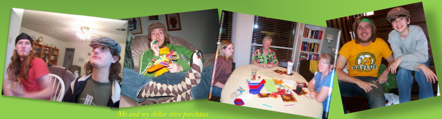
Me and my dollar store purchases