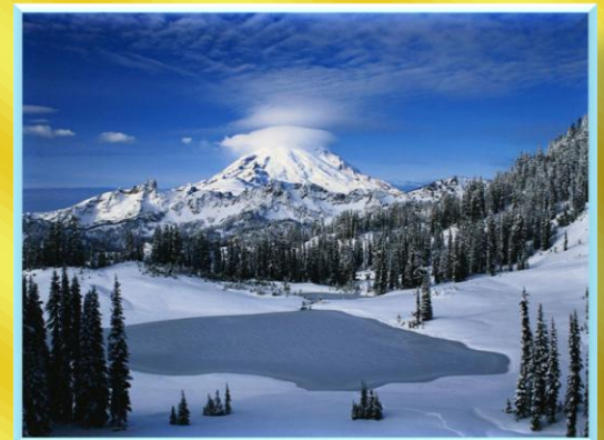
a little beauty